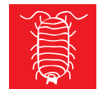
Pill or Sowbug

If a pest is detected (or suspected) in your residence, please call us!